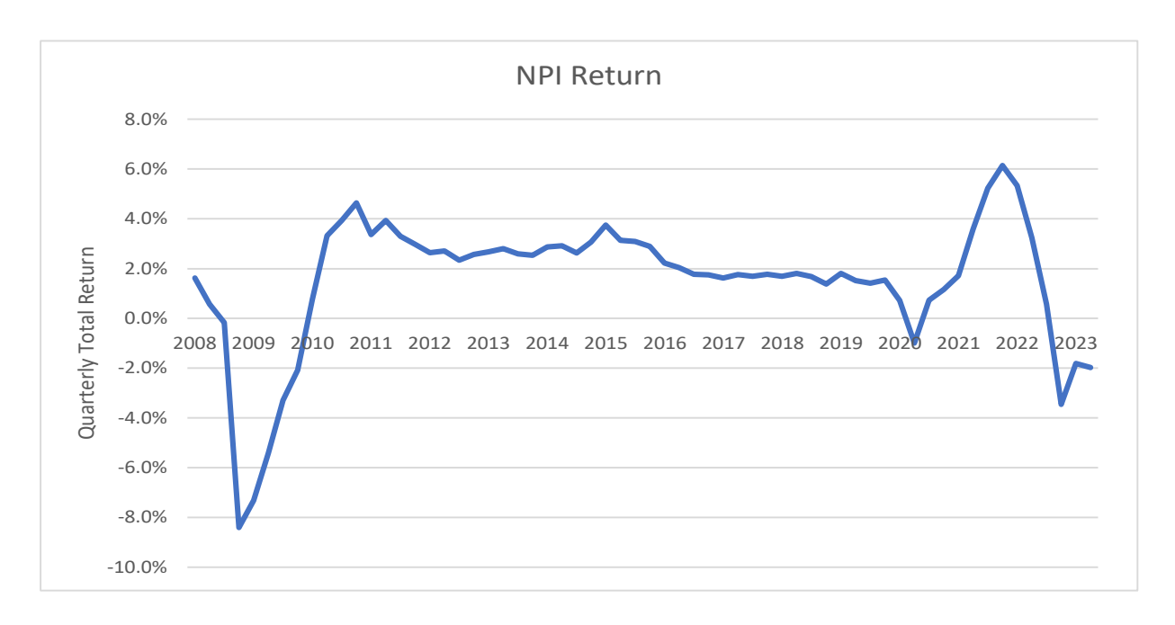
The -1.98% return is the unleveraged return for "operating properties" held by institutional investors throughout the U.S. As of quarter-end there were 4,687 properties with leverage and the weighted average loan to value ratio was 45%. Lower unleveraged returns coupled with higher interest rates magnified the negative return for those properties with leverage. Properties with leverage had a total quarterly return on equity of -4.33%. The average interest rate on the leveraged properties rose to 4.73% (annualized) for the second quarter, up slightly from 4.71% in the first quarter of 2023. A handful of properties had values which were equal to or less than their loan balance and a few additional properties were returned to the lender.